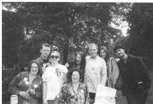
LGB Soc plus friends at the Fools Fete, Abington Park '93

In a way, I'm sorry that this isn't going to be a dramatic story of conflict - it would probably be more effective - but (unlike many others) I haven't experienced any violence, verbal aggression or any other particularly negative responses to my expressed homosexuality whilst at Nene. It certainly isn't a result of me hiding it - I haven't kept it particularly quiet. I wear badges that visibly proclaim my sexuality and speak to staff and students quite openly about my personal life.